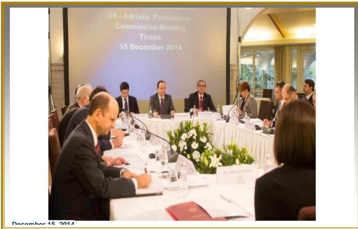
Ministerial Meeting of the US-Adriatic Charter held in Tirana on 15 December, 2014

The meeting of the Partnership Commission of the US-Adriatic Charter at the level of Ministers of Foreign Affairs was held today in Tirana. This meeting was chaired by the Minister of Foreign Affairs Ditmir Bushati, in the quality of chairman of the US-Adriatic Charter during this year.